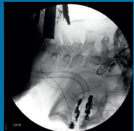
Disk Replacement Cervical Spine