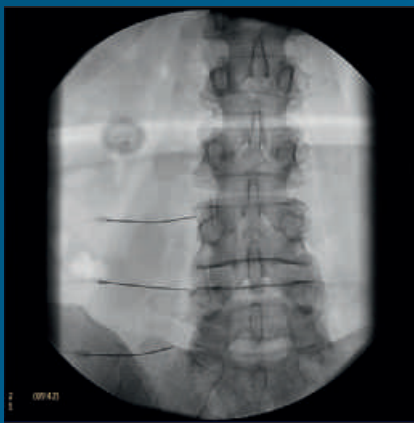
Pain management Lumbar Spine

“The surgeons are very happy with the image quality,” notes Brooks. They have good reason to be. Veradius Neo employs flat detector technology for undistorted, high contrast images to help visualize complex bone structure, device detail, and tortuous vasculature. First time right, high quality images speed decision-making and help reduce the need for repeat exposures.